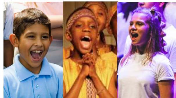
Recording Solo voices