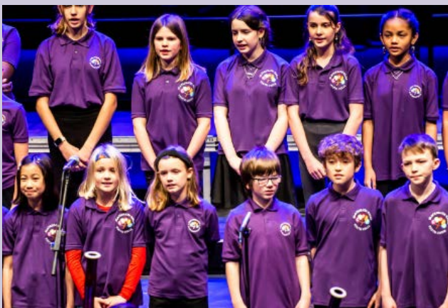
An example of a well-framed, well-lit landscape shot.