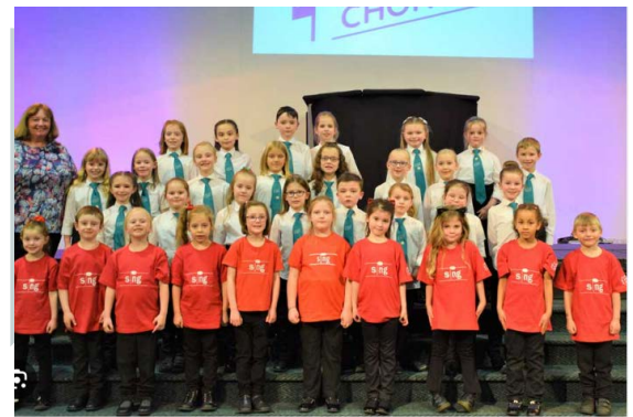
How to frame your choir